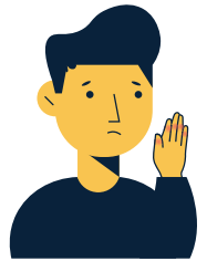
Red, purple or blueish lesions (spots) on the feet, toes or fingers without clear cause

If yes, stay home and contact 811 to be screened for testing for COVID-19.