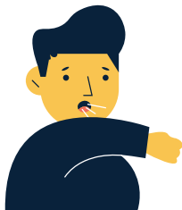
Cough or worsening of a previous cough