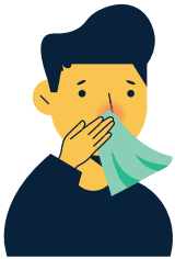
Nasal congestion/ runny nose